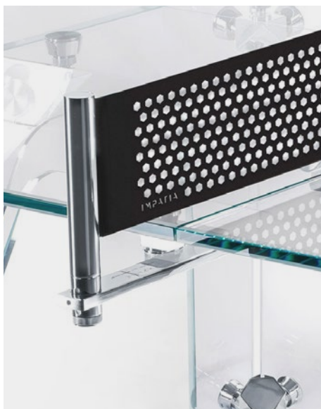
Removable Alcantara Net